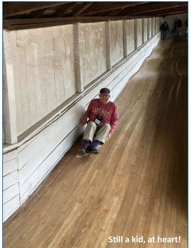
Still a kid, at heart!