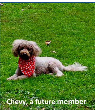
Chevy, a future member