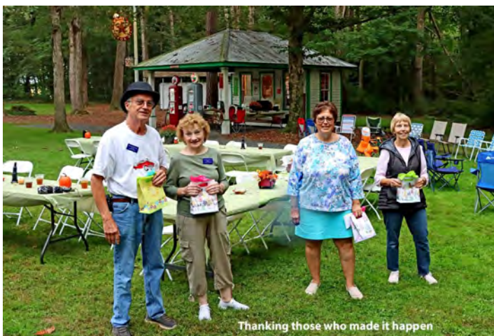
Thanking those who made it happen