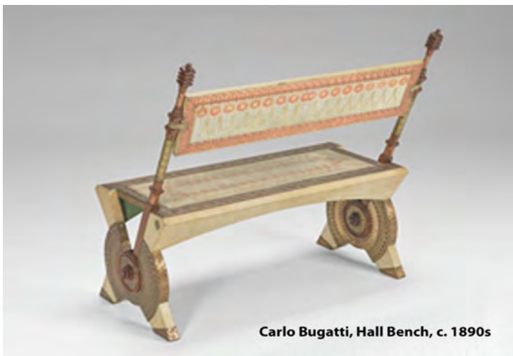
Carlo Bugatti, Hall Bench, c. 1890s