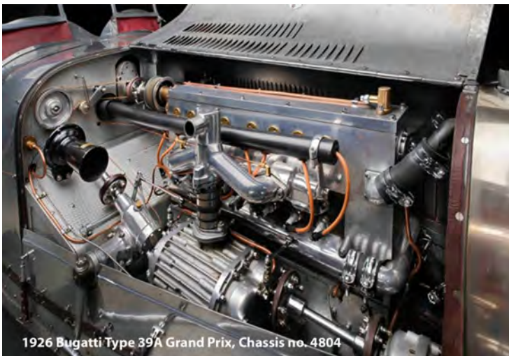
1926 Bugatti Type 39A Grand Prix, Chassis no. 4804