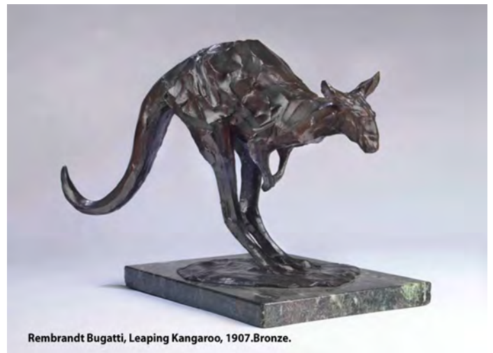
Rembrandt Bugatti, Leaping Kangaroo, 1907. Bronze.