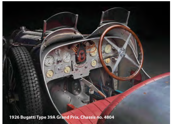
1926 Bugatti Type 39A Grand Prix, Chassis no. 4804